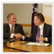
Minister Debus and the ACT Chief Minister sign Centenary of Canberra Intergovernmental Agreement

On Friday 12 December 2008 the Minister for Home Affairs Bob Debus and ACT Chief Minister Jon Stanhope signed an intergovernmental agreement confirming the Commonwealth and ACT Government's commitment to work in a genuine partnership to plan the 2013 Centenary of Canberra celebrations.