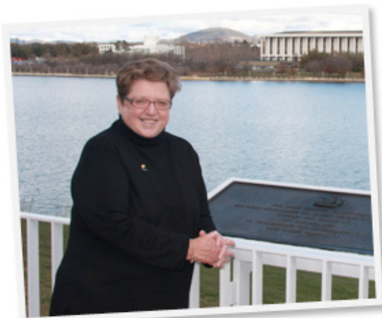
Ms Robyn Archer AO is the Centenary of Canberra Creative Director

Robyn Archer AO Creative Director Centenary of Canberra