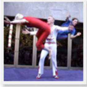
Acrobats from Dislocate

Ensure you're a part of FlipArt! Visiting Garema Place and Civic Square to see the best in physical theatre in Canberra on 12 and 13 March.