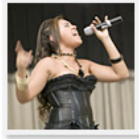
Jessica Mauboy performing at Celebrate in the Park 2009.

For further information keep your eye out for the Canberra Times lift out in early March or visit www.events.act.gov.au