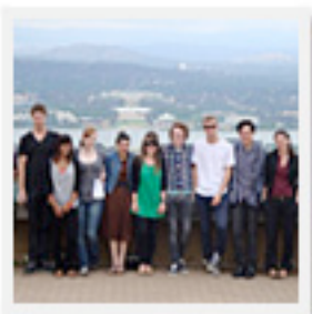
The eleven young designers – representing every state and territory – on the viewing platform of Mount Ainslie

The work generated during this process has provided fresh visual stimulation around the goals of the Centenary. It also tapped into one of the Creative Director's goals to ensure that the Centenary is celebrated as much in each state and territory as in the capital itself, and this project was a simple way of engaging the rest of Australia in the conversation regarding the capital's 100 th birthday.