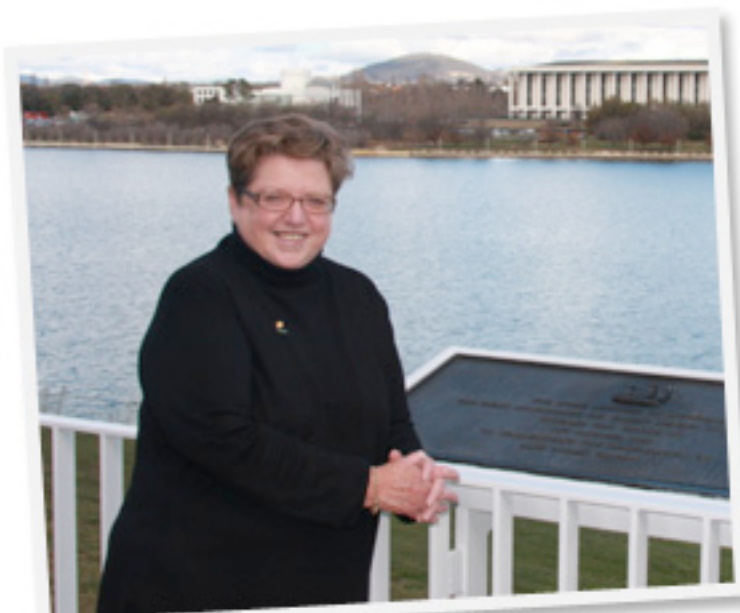
Ms Robyn Archer AO is the Centenary of Canberra Creative Director

Channel Vision have created a short profile piece further detailing Robyn's first impressions of Canberra and the centenary project. To view, visit www.channelvision.com.au and select Shows > Born from a Vision > Robyn Archer.